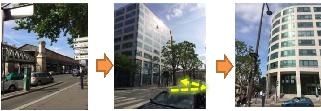
Nearest subway station to the venue, Quai de la Gare.

Address: 190 avenue de France, 75013 Paris, France Website: <a href="http://ffj.ehess.fr/">http://ffj.ehess.fr/</a>